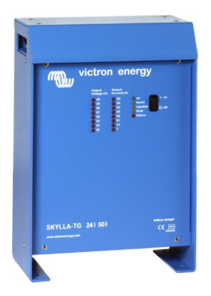
Skylla Charger 24 V 50 A